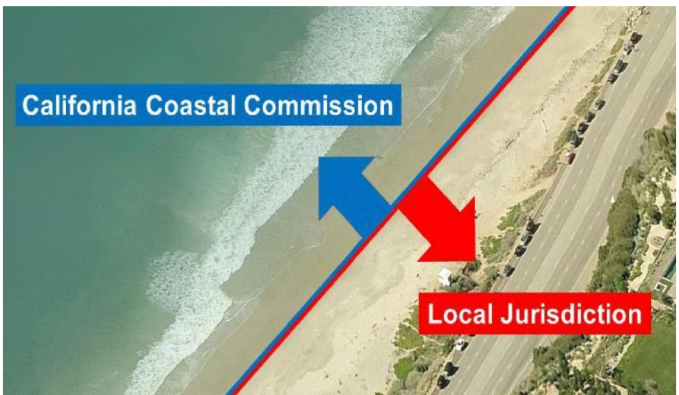
Illustrative representation only. Please confirm with the appropriate jurisdiction when the filming location is known. The mean high tide line typically includes portions of the beach that are often, but not always, covered in water.