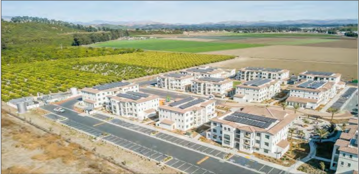
Aerial photo of the completed Somis Ranch Farmworker Housing Complex (2025); Photo credit: AMCAL California Affordable Communities

In February 2021, the Board of Supervisors approved a subdivision and discretionary permit application for a 360-unit farmworker housing complex in the unincorporated county, near the City of Camarillo. The approved project included waivers for reduction of internal side-yard setbacks from 15 feet to 10 feet, and incentives in the form of an increase in building lot coverage (from 5% to 25%). The Somis Ranch Farmworker Housing project maintains a 100 percent affordability requirement, where all 360 units must be rented to low- and very low-income residents. Additionally, the units will be rented at affordable rents not greater than thirty percent (30%) of sixty percent (60%) of the monthly area median income (AMI) for low-income households, and not greater than thirty percent (30%) of fifty percent (50%) of the monthly AMI for very low-income households (including some units for extremely low-income households at rents not greater than thirty percent (30%) of thirty percent (30%) of the monthly AMI). The project consists of two phases. Construction for Phase I for the first 200 units began in 2023 and certificates of occupancy were issued in 2024. Additionally, building permit applications were approved for the remaining 160 units in Phase II in 2023. Construction of Phase II has been completed, and it is expected that certificates of occupancy will be issued by early 2025.