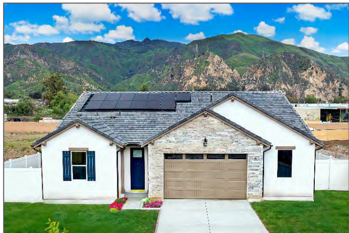
One of the constructed homes in the Finch subdivision; Photo credit: Williams Homes

In the community of Piru, the Finch and Reider tract maps were recorded in December 2018. At full buildout, the Finch Tract (now known as Williams Homes) will include a total of 175 housing units and 10,800 square feet of commercial development. The housing units include 62 detached single-family dwellings, 85 detached condo units, two duplexes (4 units), six triplexes (18 units), and six units in a mixed-use building along with commercial use. Subdivision improvements are nearing completion, and residential construction commenced in Summer 2023. As of December 2024, the Planning Division has issued Zoning Clearances for construction of 123 units and certificates of occupancy for 81 units.