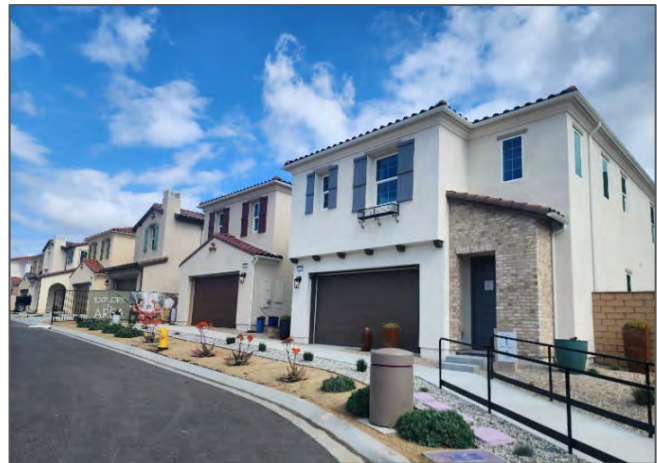
Photo of single-family dwellings constructed as part of Phase II of the Anacapa Canyon Development

One building permit was approved in late 2020 for Phase 2 of the East Campus Development area (now known as Anacapa Canyon development). This phase anticipates the construction of a total of 589 units consisting of: 310 market rate apartments; a combination of 109 for-sale single-family homes and attached single-family townhomes; and 170 apartments for seniors with affordability restrictions in place. The senior apartments will be subject to certain age, income, and rent restrictions and will be funded, in part, through tax credits under the Low-Income Housing Tax Credit (LIHTC) program under Section 42 of the Internal Revenue Code. The primary occupant of these units is required to be at least 55 years old, with an income of no more than 60 percent of the AMI. Rent for these units will be capped at a level determined by the AMI and HUD.