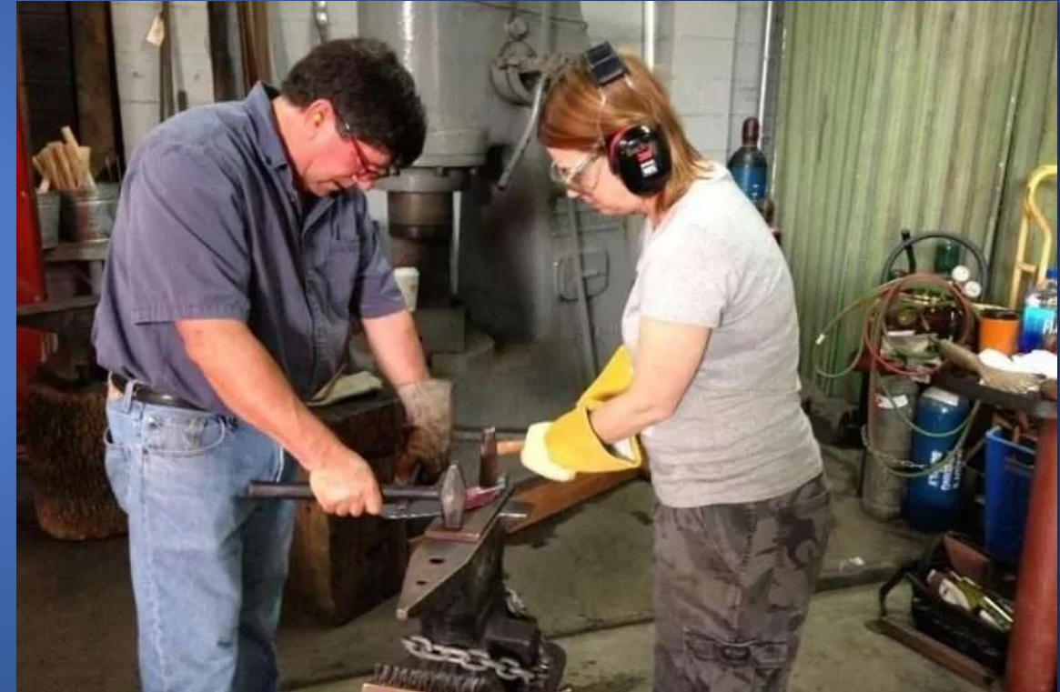
Blacksmith Class at Adam's Forge