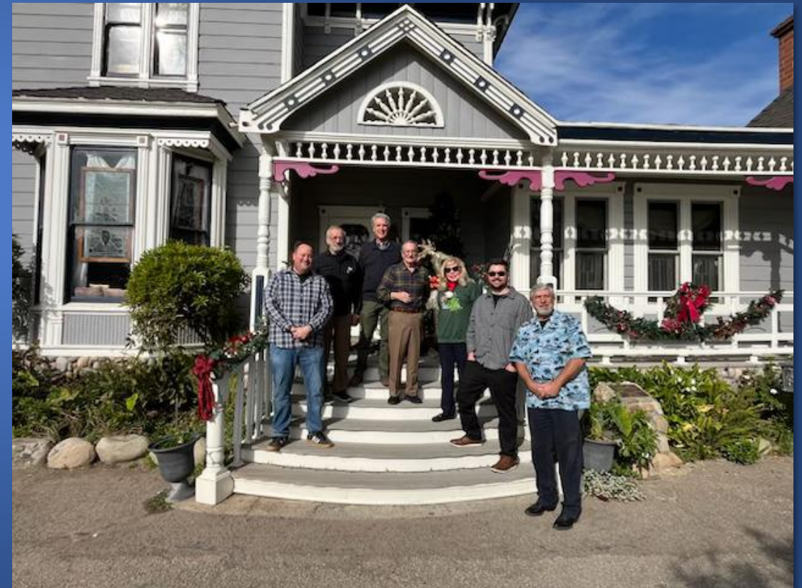
Scarlett/McGrath Ranch luncheon, December 2024 (Ms. McGrath in green)