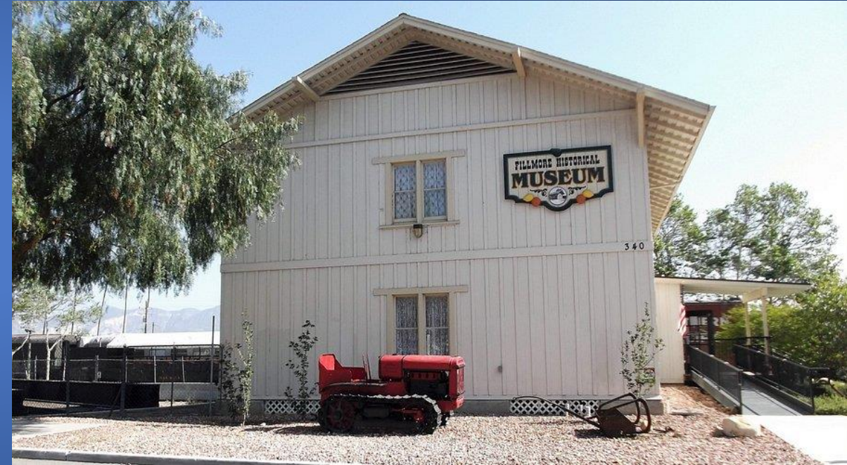
Fillmore Historical Museum