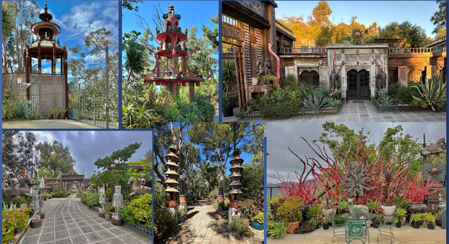
Collage of Contributing Resources to the Tony Duquette Historic District